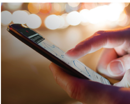
Fig. 1—Weatherford's enhanced ForeSite provides predictive failure analytics for ESP systems and optimization capabilities for plunger-lifted wells.

Weatherford introduced an enhancement of the ForeSite production-optimization platform. Among the features of the new release is expanding predictive failure analytics to electrical-submersible-pump (ESP) systems and adding complete optimization capabilities for plunger-lifted wells. The plat-