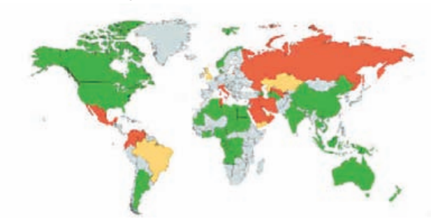
Figure 1. Annual statistic report on world reserves: crude production quality based on data from 2015

Whether it is oil or gas bearing, conventional or unconventional, when a field contains H<sub>2</sub>S above a certain value it is qualified as sour. Even though it presents several difficulties, the development of sour (rich in H<sub>2</sub>S and CO<sub>2</sub>) oil and gas fields is quickly emerging as a major industrial and technological theme. Such interest for sour resources arose because of two main factors: first, the diminishing accessibility of easy-to-produce conventional oil and gas makes attractive also the development of high H2S fields; second, there has been an increase of operations in areas traditionally rich in sour resources like Russia and the Middle East (Figure 1).