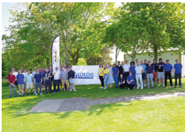
Aberdeen charity tournament participants

Attendees were treated to lively performances by the talented musicians from Mariachi Mi Mexico en Houston, enhancing the vibrant atmosphere throughout the course. Meanwhile, golfers competed passionately for top honours, including the Longest Drive, Closest to the Pin, and Best Slice trophies. The presence of the PBE Podcast team conducting interviews with Energy Leaders added an extra layer of excitement and helped raise awareness for our charitable cause.